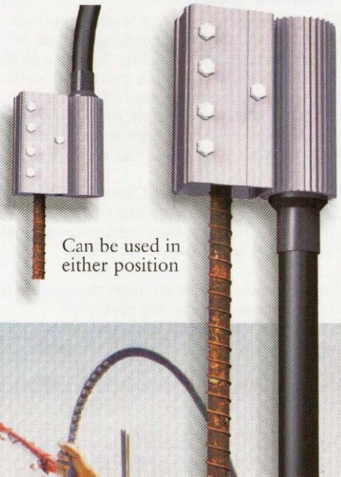
Can be used in either position

Tremendous savings in man-hours, from filling and refilling cells, clean-up and lost time due to injury from slips and falls, are realized through the use of the Rebar Shaker.